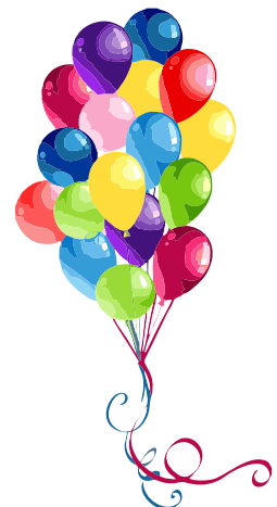
(clipart from Corel Draw x3)