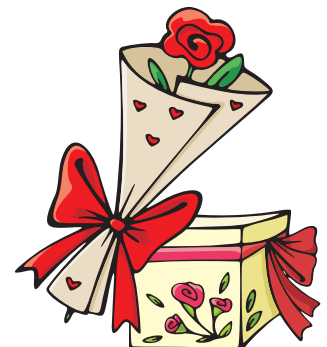
(clipart from Corel Draw x3)